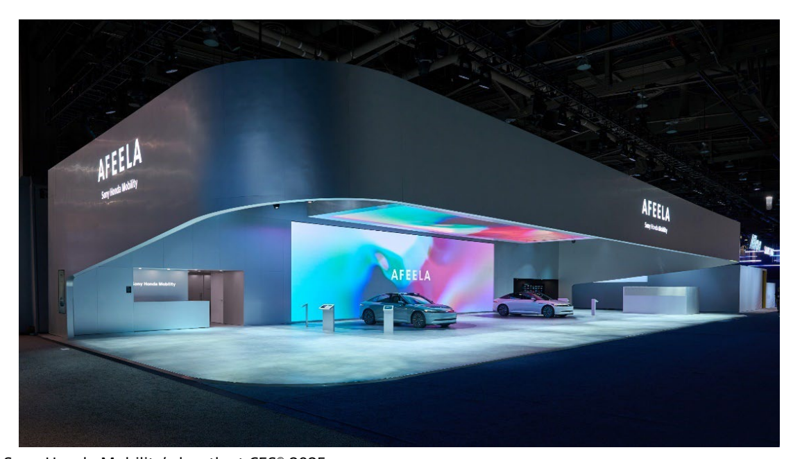
Sony Honda Mobility's booth at CES® 2025

During the public exhibition period of CES® 2025, the booth showcases and introduces the AFEELA 1 Signature to visitors. SHM also showcases its partner companies collaborating in the development of AFEELA, as well as kiosk of high-quality functional materials used in the interior of AFEELA 1, presenting SHM's vision for the future of mobility.