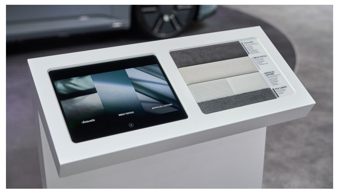
A kiosk of high-quality functional materials used in the interior of AFEELA 1

For details, please see the following press releases and press conferences announced by Sony Honda Mobility at CES® 2025. For media assets, please download from the media resources.